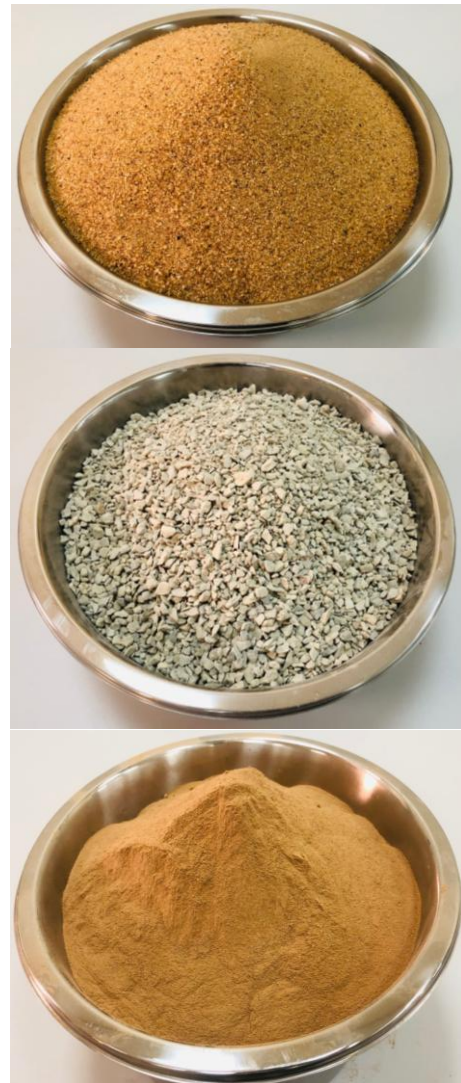
Figure 1. Sand, gravel and clay used to make specimens.

A stabilized rammed earth mixture typically consists of sand, gravel, and clay as shown in Fig. 1. Sand and clay were provided from the available areas in the southeast of the Qassim region in Saudi Arabia. A type I Portland cement was also added to the mixture, which complies with the Gulf and Saudi standards No. SASO/GSO 1914 type I – ASTM C 150 Type I.