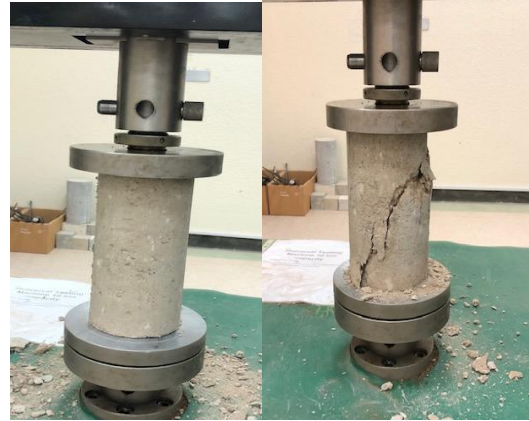
Figure 4. A cylindrical specimen under the test and after the test.