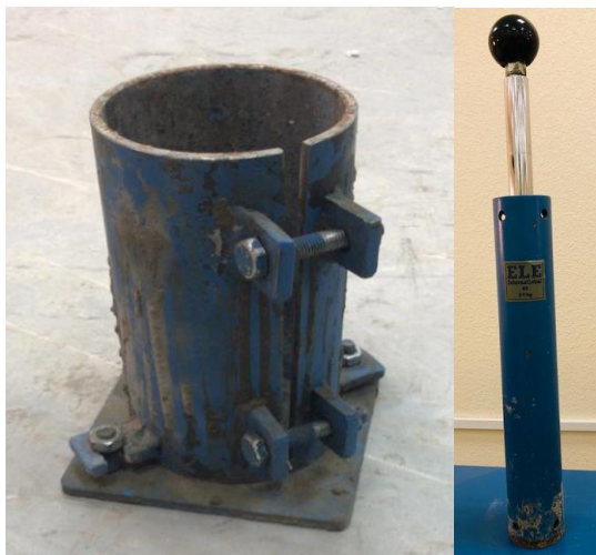
Figure 2. The mold used in preparing the specimens and the rambler that was tamping the mixture.

The specimens to be tested were extracted from the mold after 24 hours. Then they were cured for 7 days at room temperature. The specimens were tested using a universal test machine as shown in Fig. 3 with a speed rate of 1 mm/min. Fig. 4, shows a specimen under the test and after the test